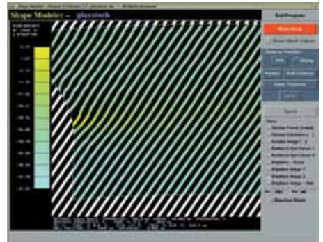
Shape Modeler® proprietary software mathematically reviews and evaluates new automotive glass designs and predicts the design's optical quality.

For the continuing service that keeps your Glasstech system up-to-date and operating efficiently over the long haul, interested parties should contact their Glasstech representative or the Glasstech Aftermarket Sales Department (Aftermarket@glasstech.com).